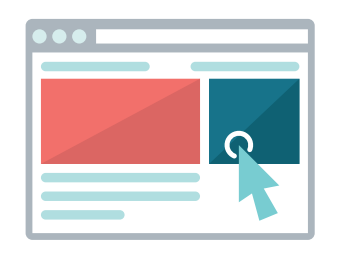
51% — Building a presence on job search websites