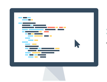
39% – Conducting virtual job interviews