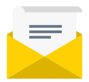
50% — Offering an employee referral program